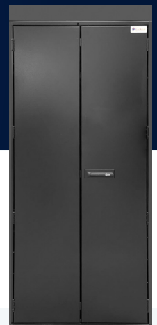
Extension locker (no terminal)