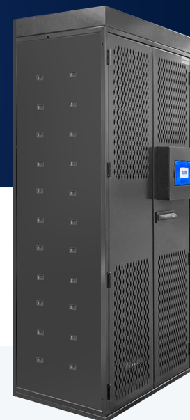
Primary locker (with embedded touchscreen terminal)